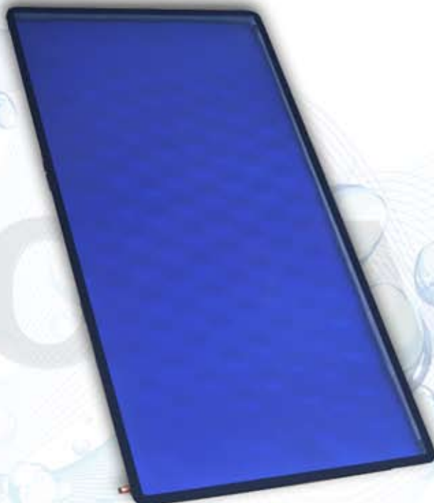
VTTi NOVASOL model